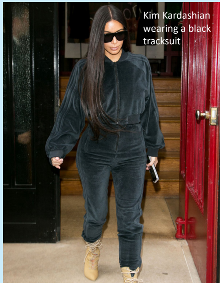
Kim Kardashian wearing a black tracksuit

have the energy to pick out a proper outfit.