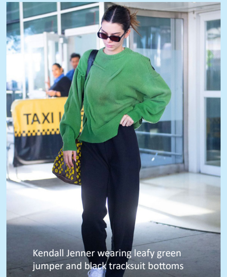
Kendall Jenner wearing leafy green jumper and black tracksuit bottoms